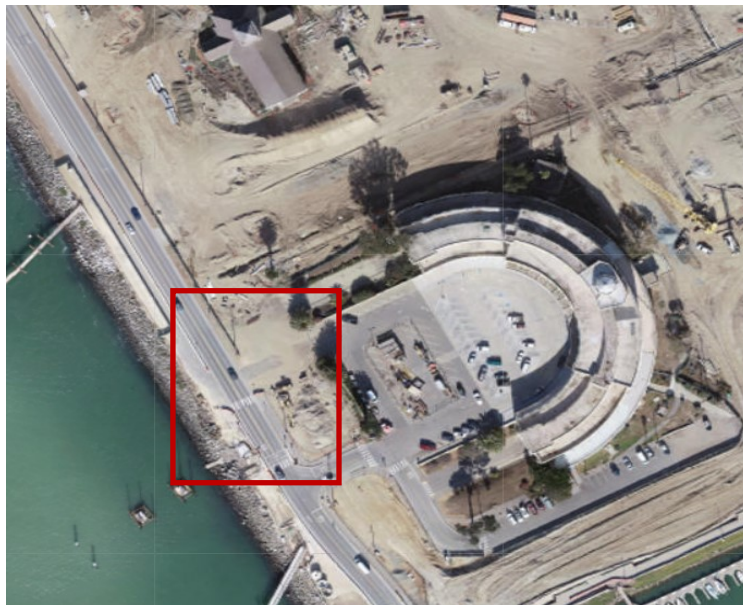
Avenue of Palms daytime work zone. See 2nd page for TICD traffic control plan

TICD Construction Hotline (888) 469-0797