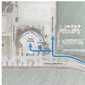
BUILDING ONE ACCESS FROM CLIPPER COVE

TICD Construction Hotline (888) 469-0797